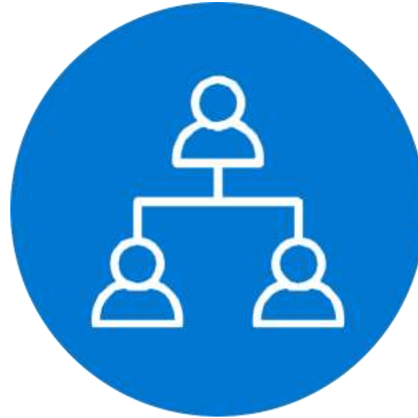
KYC & ENHANCED DUE DILIGENCE