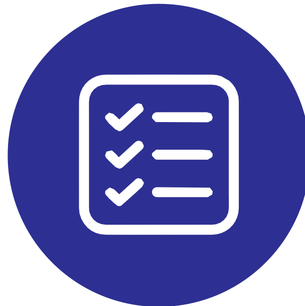
AUDITS & ASSURANCE