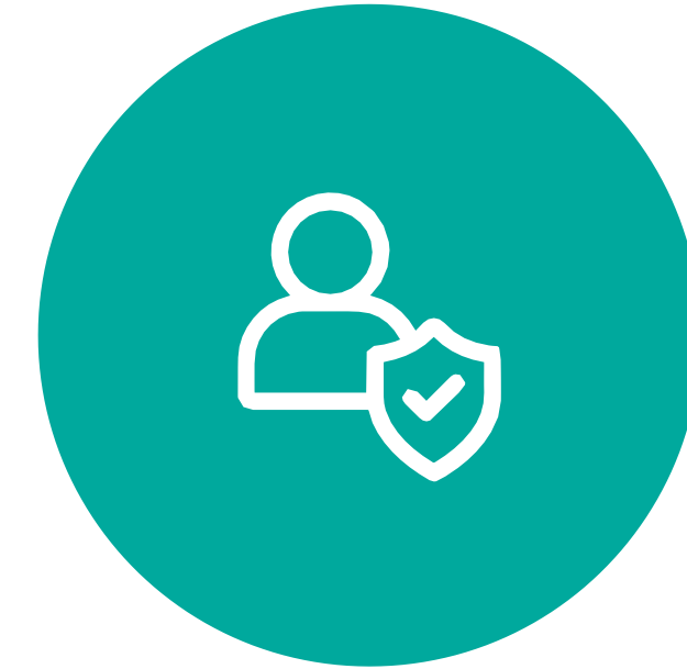
COMPLIANCE AND ETHICS PROGRAMS